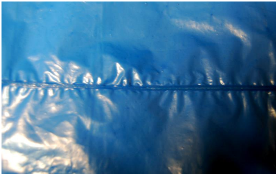
Figure 2. Appearance of multilayer welded joint of the blue polyethylene film

Experimental welding of 0.05 mm blue polyethylene film is carried out. With 10–20 W laser power and selection of appropriate value of displacement speed, from two to eight layers of polyethylene film are welded well. In order to reduce the concentration of energy during thin film welding, the beam is defocused to the diameter of 1.5–2.0 mm on the material surface. As the result, relatively uniform weld with nice appearance (Fig. 2) is obtained, which in terms of its external and strength parameters is not inferior to similar welds made by heated tool welding.