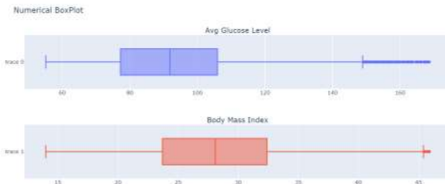
Figure 2. Avg_glucose_level and bmi data after removing outliers

Now let's look at this data after removing the outliers, as shown in Figure 2: