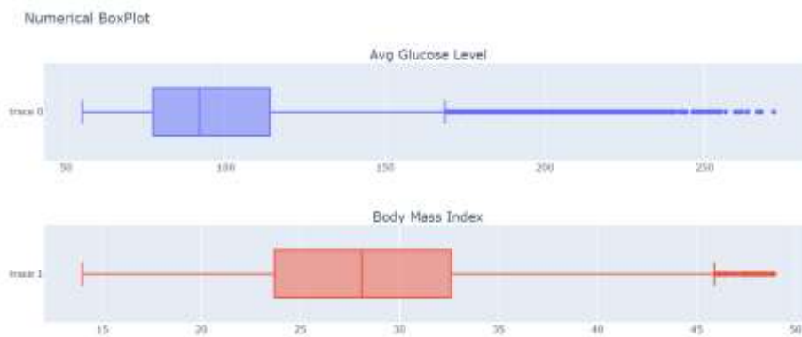
Figure 1. Avg_glucose_level and bmi data before removing outliers

First, let's look at the results of removing outliers in the data. Figure 1 shows the avg_glucose_level and bmi before outliers are removed: